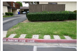
Diagram 5 Water Shut Offs