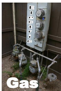
Diagram 2 Gas and Electric Meters