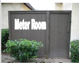
Diagram 1 Meter Room

The water shut offs are easier to locate. (see diagram 5). The water boxes are located in the front of the courtyards. Usually on the right side. Looking at the courtyard standing in front of the water boxes you can identify them by counting the units from left to right. Once you reach the identifying unit, count the water boxes from left to right. Once you have identified your box, you will need to remove the cover carefully. Use the flathead screwdriver to help ease the cover off. Once this is done you will have access to the shut offs. Locate the ball valve next to your meter and turn it so it is perpendicular to the meter. This will turn off the water to the selected house.