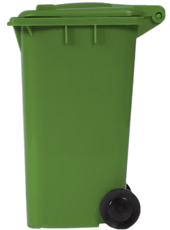
32-gallon cart 24.3"x 19.8" x 37.5"

For assistance with cart deliveries/exchanges and bulk item pickups, please reach out to 619.421.9400 and reference Mesa Village HOA at 10540 Caminito Baywood, San Diego.